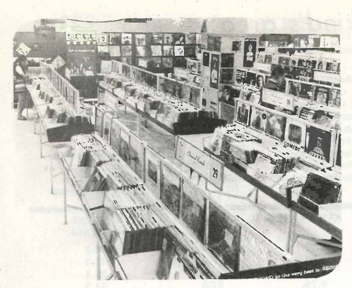
The well stocked Morgans main store (Montreal) one of the reasons Pindoff Record Sales heading for banner year.