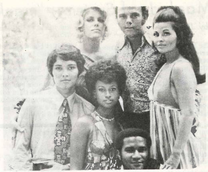
Celebration, scoring good houses at the Seaway Beverly Hills, have just signed with Motown (Ampex in Canada).