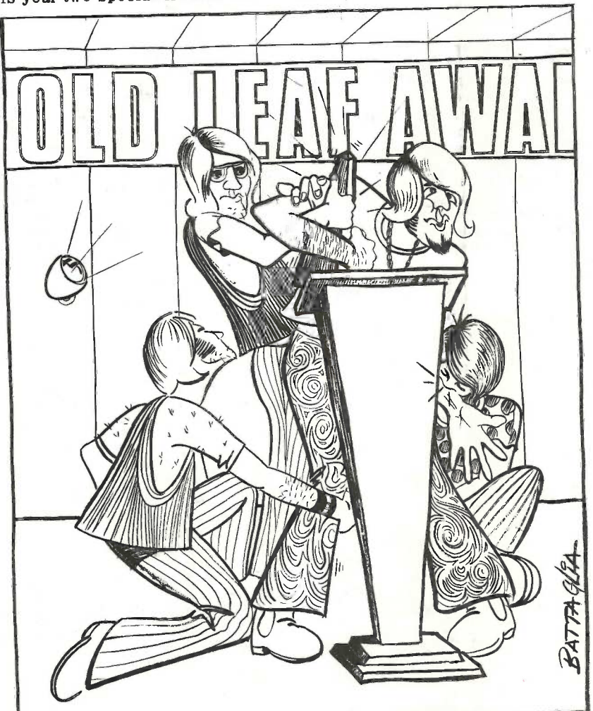
".....t would like to accept this Award on behalf of everyone who made it possible, the group....."

In the case of artists and record companies, the poll is effective on a national basis. In the case of regional activities eg. radio stations, it is difficult for the national vote to show any consistency. Also in the case of the music industry figures of the year, the broad vote has, in the past, shown great inconsistency because of the regional influence. It was decided this year that RPM would make these two choices and make special Awards in these two particular categories.