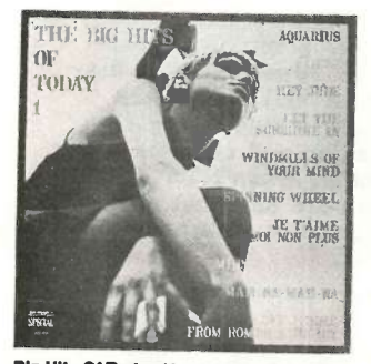
Big Hits Of Today/1 • Polydor Special 242009 • A grab-bag of past hits played in an easy-listening manner. Among the top numbers in this set are: "Aquarius", "Hey Jude" and Love Theme from Romeo & Juliet. A budget price album to fit all moods.