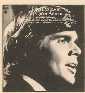
MY CHERIE AMOUR John Davidson-Columbia-CS-9859-H Strong album seller has another win-ner with this set. Recorded in England. Lotsa lush backing.