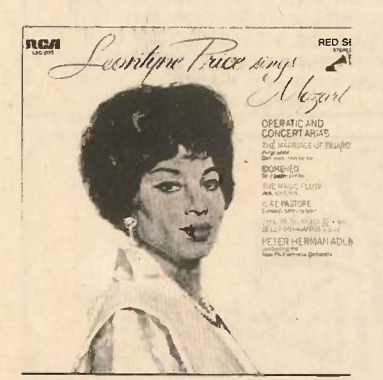
LEONTYNE PRICE SINGS MOZART RCA Red Seal-LSC-3113-N - Oper-atic and concert arias of Mozart with excellent backing by New Philharmonia Orchestra