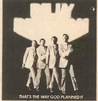
THAT'S THE WAY GOD PLANNED IT Billy Preston-Apple-ST-3359-F Title song drew much attention. Set could move Preston into big seller list.