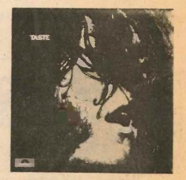
TASTE Polydor-583 042-Q Keep your eye and ear tuned to this British group. North American appearance will add much importance to this blue eyed blues set.