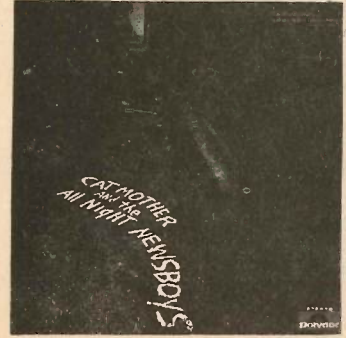
THE STREET GIVETH AND THE STREET TAKETH AWAY Cat Mother & All Night Newsboys Polydor 24 4001-Q Group making moves up singles charts. Should strike it rich with this set.