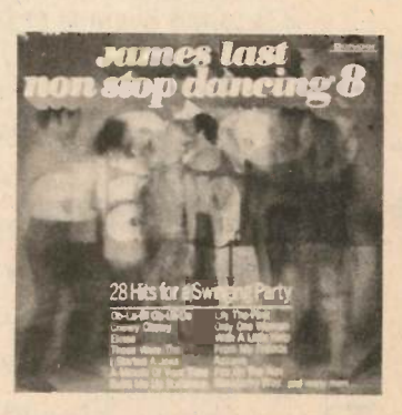
NON STOP DANCING 8 James Last-Polydor-543.040-Q "'Ob-La-Di Ob-La-Da", "'Chewy Chewy" and other past hits make Last's first set with individual cuts and times a natural for sales.