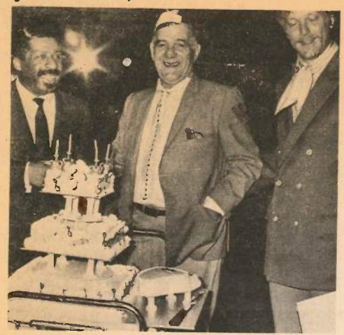
Photo on left shows (I to r) Erroll Garner, MGM recording star, Isy Walters presenting popular entertainer with four-tier cake during 48th birthday party at Isy's nightclub in Vancouver, and