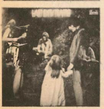
LAST EXIT Traffic-Polydor-543026-Q Group could command top sales with proper handling. Side 2 recorded live at Fillmore West, Produced by Jimmy Miller.