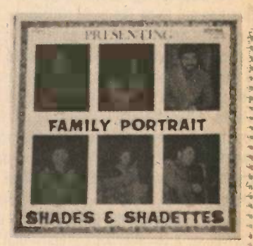
FAMILY PORTRAIT Shades & Shadettes-Vintage-SCV 102-S Lacks originality, but group shows much potential with proven hit material. Good kick-off for new label.