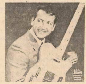
RODEO - 3316