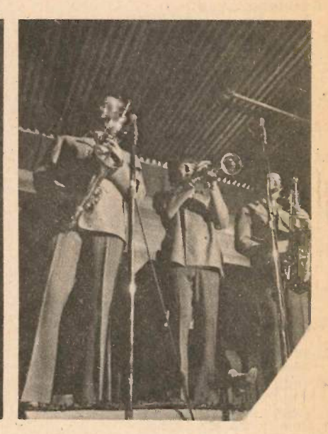
Canada's Fastest Rising Group - Ten men and a big sound thing!

Watch for the release of our first single!