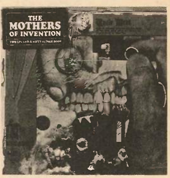
UNCLE MEAT Mothers Of Invention Bizarre- 2024-P 2 record set. This is the old Mothers sound, 67-68. Effectively displayed, could sell well.