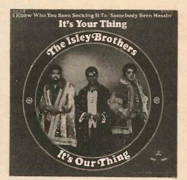
IT'S OUR THING Isley Brothers T-Neck TNS 3001-M Contains winning single "It's Your Thing". Not strictly R&B, Excellent "progressive" sound.