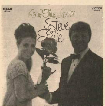
REAL TRUE LOVIN' Steve & Eydie RCA LSP 4107-N Many broadcasters agree this is the duo's best yet. Dealer back ordering also good indication of sales potential.