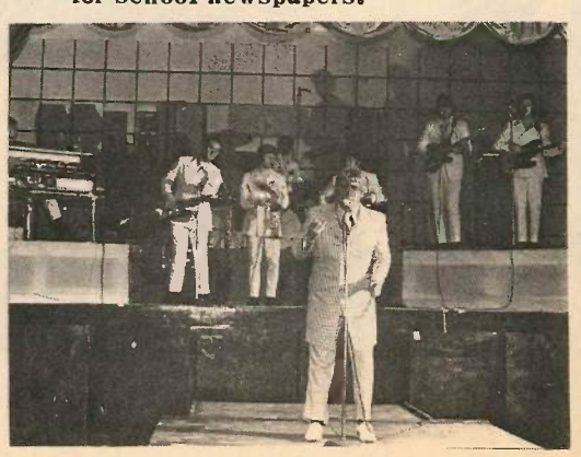
Rhythm and Blues group, The Tongs.