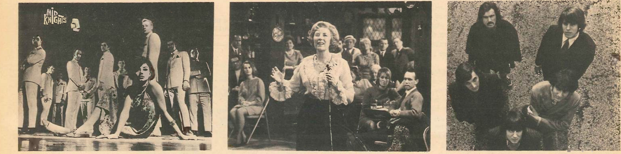
The MidKnights have a strong release on WB/7 Arts