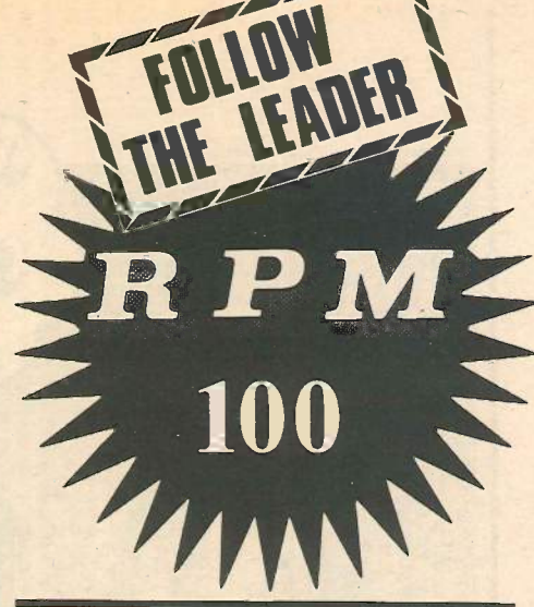
Chart # 61