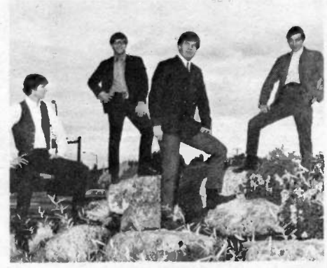
Winnipeg's famous Guess Who were one of the first Canadian groups to break the international sound barrier. They did it with "Shakin' All Over" and have established themselves as a group to watch. Their current hit "His Giri" took the English charts by storm and it would appear that the world is waiting breathlessly for further Guess Who releases.

Canadians keep coming, and spread that sound.