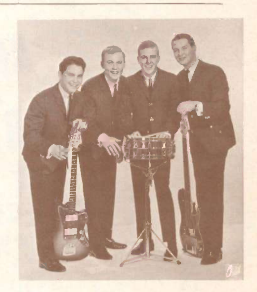
The Sceptres, one of Montreal's top rated groups, have just released "Can't Get You Off My Mind" and "Be My Love" on the Fi-Sound label, which is distributed by Allied Records.

As the chart grows in acceptance with record companies, it will be made available nationally. Many record companies are already taking advantage of the low ad rates and dealer and consumer reaction has been something short of fantastic. See page 5.