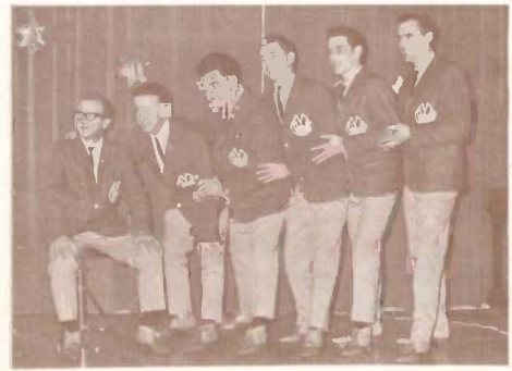
Casl recording artists The Carlton Showband

of the fastest selling singles in their roster. "Off To Dublin In The Green" was actually reorded in the famous Irish tavern by The Abbey Tavern Singers.