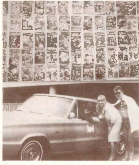
C-FUN's camp contest for comic books brought a stream of the old books to the station, a portion is shown above. Winners won a date with C-FUN's Batman and Robin

Vancouver: When the batman craze broke, two of the C-FUN Good Guys decided they needed some new reading material. A contest was run asking for old super-hero type comic books. The prize, a date with C-FUN's Batman and Robin which also included a tour of Vancouver in the