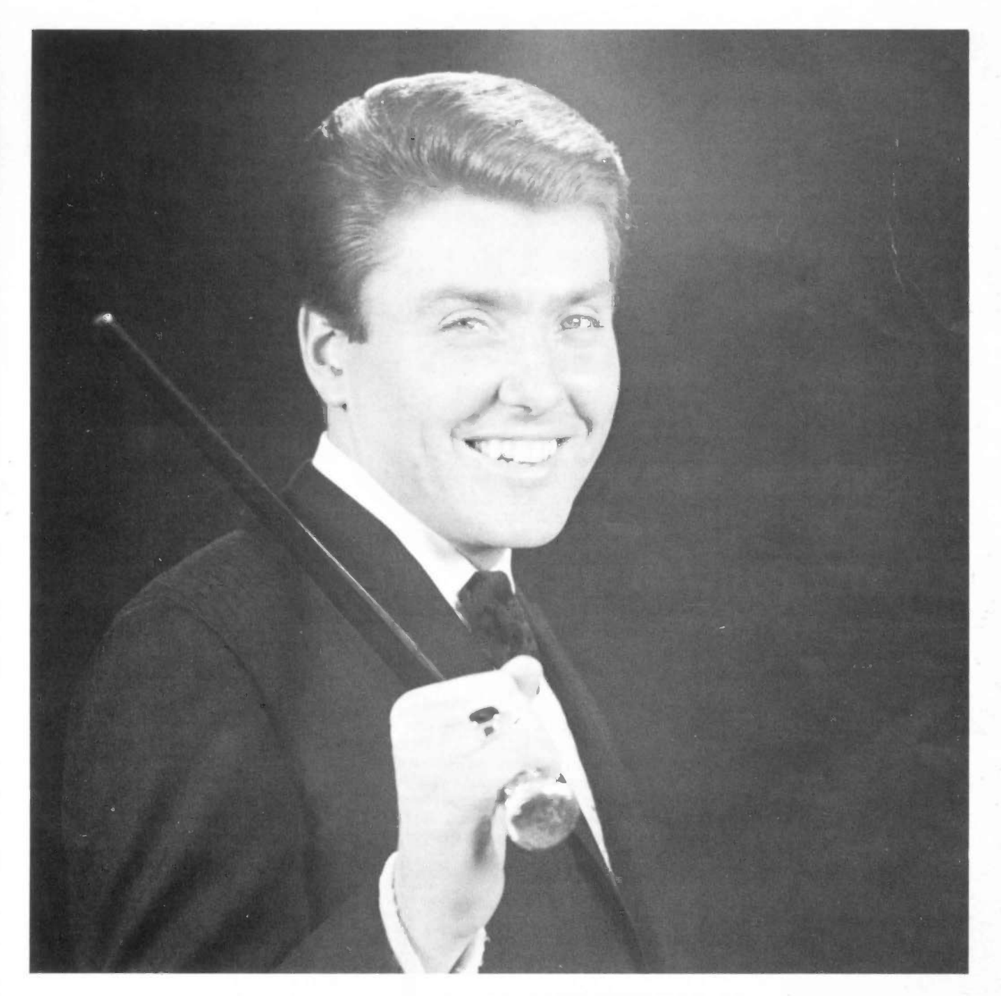
THANKS DJ's FOR PLAYING THIS RECORD AND MAKING IT A SMASH HIT AND A BIG SELLER.