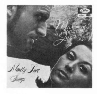
"MOSTLY LOVE SONGS"