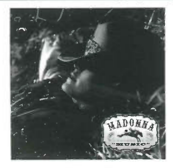
MUSIC Madonna Maverick-P