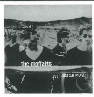
JUST ANOTHER PHASE The Moffatts EMI-F