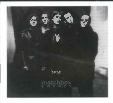
BENT Matchbox Twenty Atlantic - P