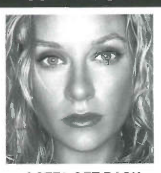
GOTTA GET BACK Shelby Lynne Island-J