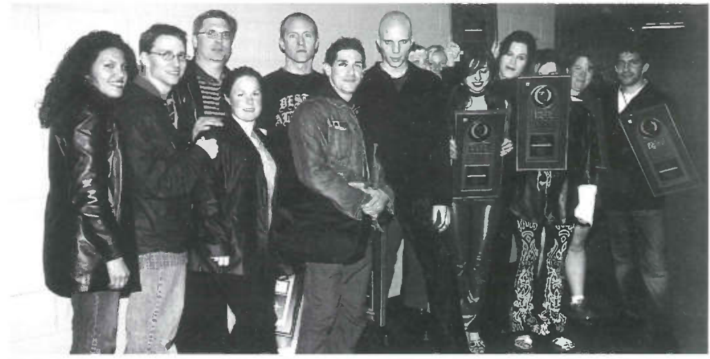
Virgin staff presented A Perfect Circle with Canadian gold for their Mer De Noms album, following their recent Vancouver show.

award submission deadline (including industry awards) is Monday, October 16. To become a member of the East Coast Music Association, you contact their Charlottetown office at 902-892-9040, or by email at <a href="mailto:ecma@ecma.ca">ecma@ecma.ca</a>.