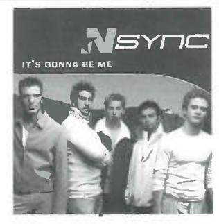
T'S GONNA BE ME *N Sync Jive/Zomba-N