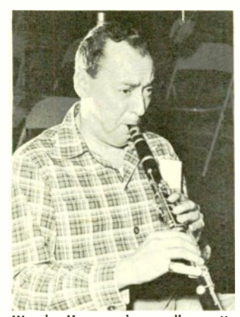
Woody Herman is usually pretty gay on the bandstand but during rehearsal he is intent as above. Result of rehearsal was a session & album, "The Woody Herman Band!"