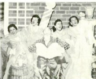
The Chordettes, one of the few female barber shop quartets, revert to type during a visit to The Last Frontier Village, Las Vegas. Their "Mr. Sandman" put 'em in big-time.