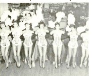
One of the prettiest lineups in Hollywood night spots are these Cuties entertaining at Ciro's where the Movie Names, Texas Oilmen and Tourists meet in merriment.